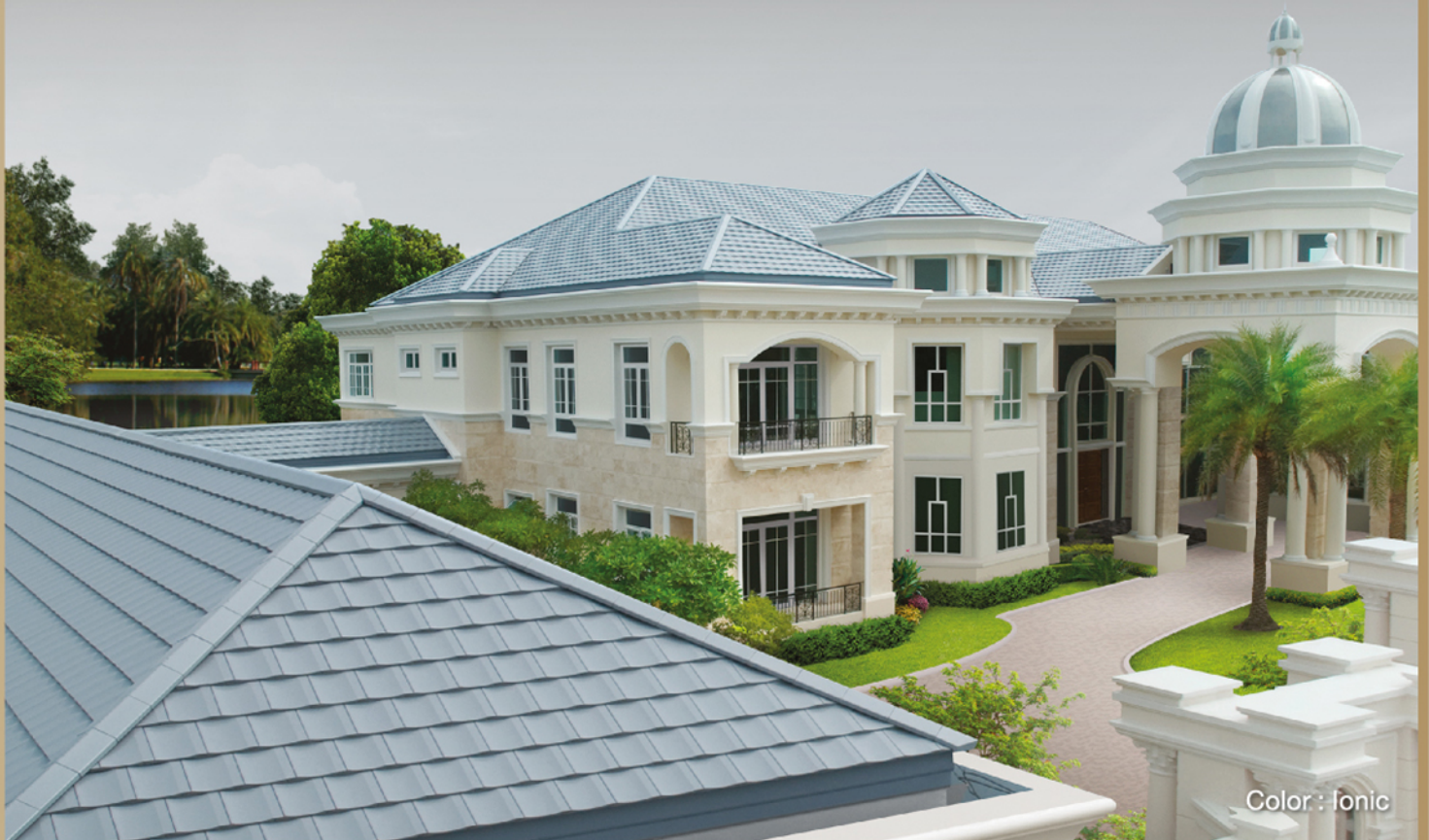
Color : Ionic