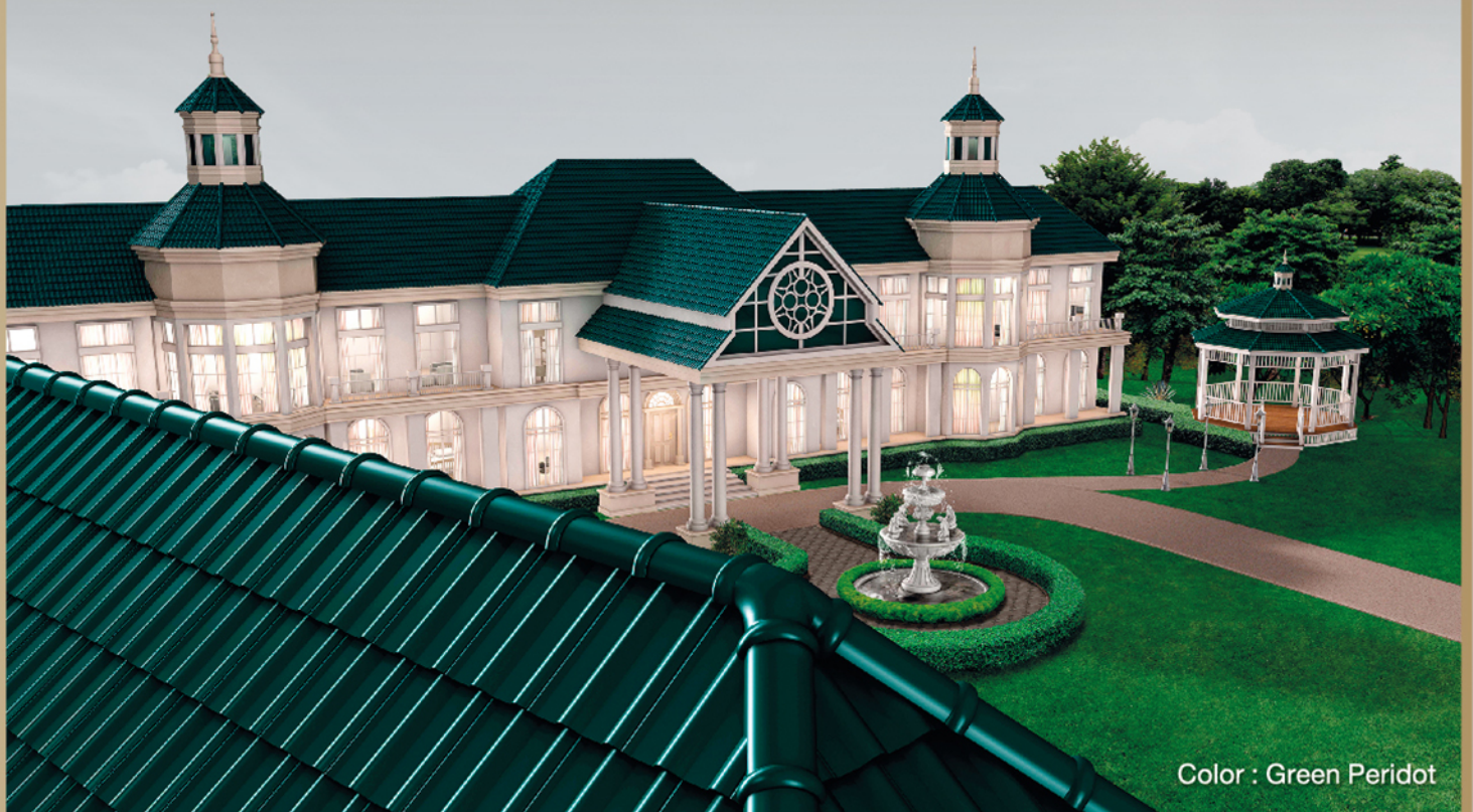
Color : Green Peridot