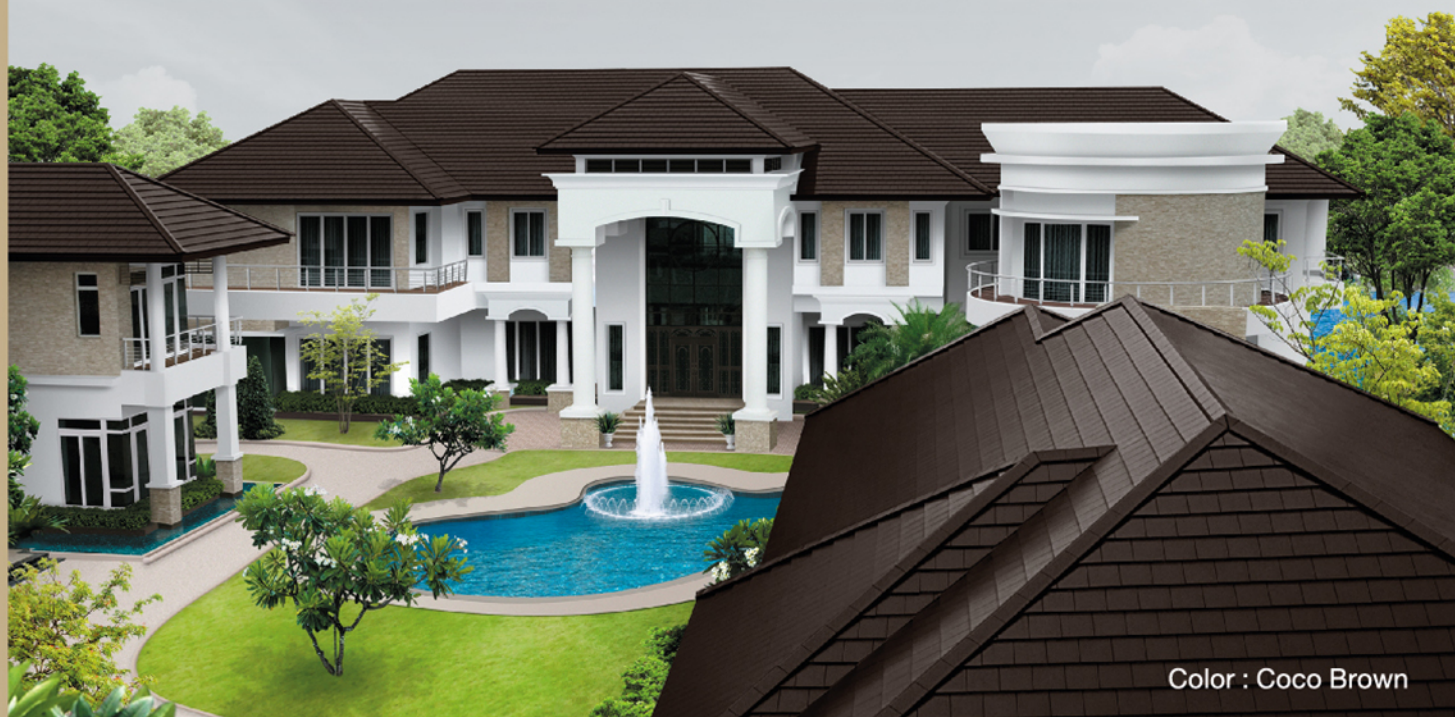
Color : Coco Brown